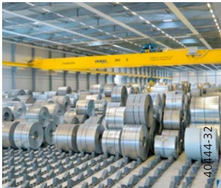
Fully automated coil store with magnets at Becker Stahlservice in Bönen, Germany