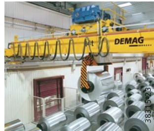
Automatic handling of aluminium coils at Pechiney Rhenalu in Rugles, France