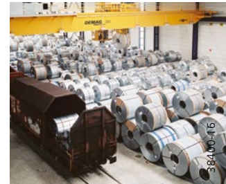
Just-in-time delivery to an automotive plant by Panopa in Wolfsburg, Germany