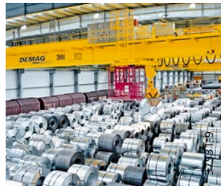
Coil handling and processing at Welser in Ybbsitz, Austria